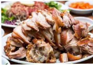
韩方猪蹄定食 / Korean Pork Knuckle