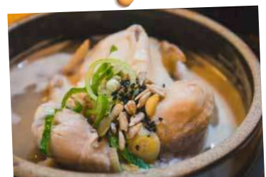
人参鸡汤 / Ginseng Chicken Soup