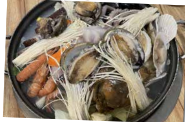
鲍鱼海鲜火锅 / Abalone Seafood Steamboat